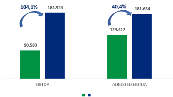
Chart 2 – EBITDA